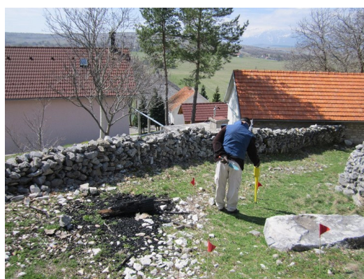
Photo 2 and 3 – Everyday life close to the area contaminated by cluster munitions