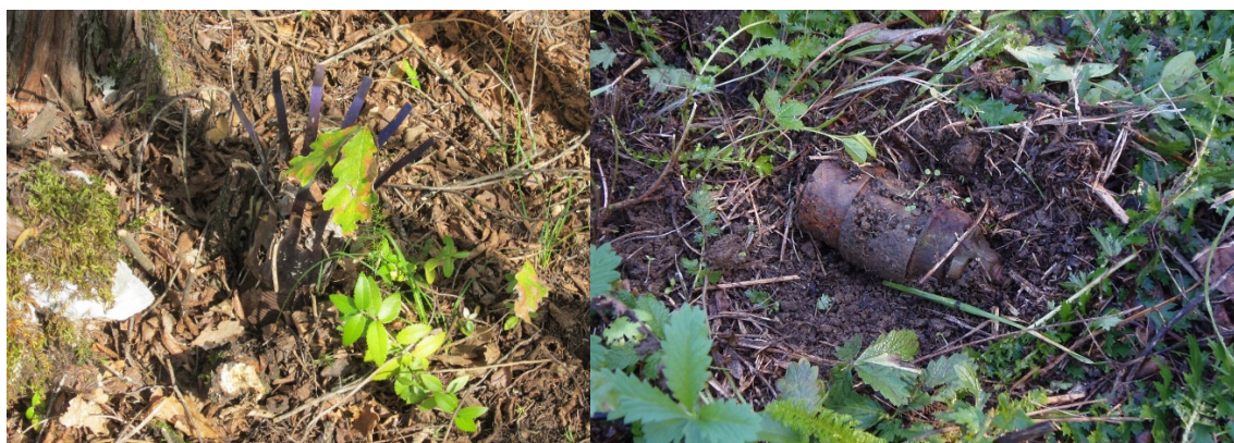
Type of cluster munition used and found in Bosnia and Herzegovina

Field operations are planned to be finished by December 31, 2022. Based on past experience and depending on weather conditions, delays are possible and deadlines can be postponed. The rest of the time for fulfilling the obligations under the Request of Extension (September 1, 2023) will be used for the finalization of the Convention report, submitting to the Implementation Support Unit of the Convention on Cluster Munitions for evaluation and adoption. Also, based on previous experience is very often that confirmed risk areas can be increased because of a lack of information about the number of fired missiles.